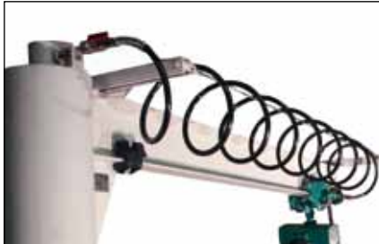
Energy supply (spiral hose)