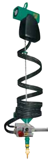
mini in manipulator version