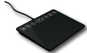
TPD 6" touchpad with 8 shortcut keys