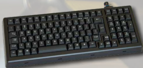
MKB104S rugged full travel - backlight