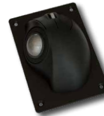
TBE38 ergonomic 38mm - panel