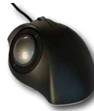
E38 ergonomic 38mm - desktop