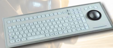
KSTL105 short travel with 50mm trackball