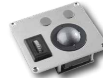
MTSX38 compact 38mm with scroll wheel