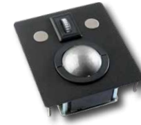
LTSX50 50mm with scroll wheel