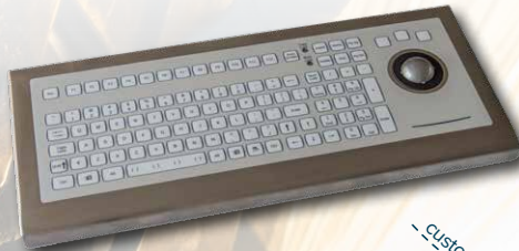
KSTM105RVS short travel with 38mm trackball