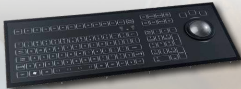
KSMX106 short travel with 50mm trackball - backlight