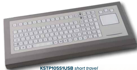
KSTP105S1USB short travel with touchpad