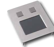
SPS55 waterproof touchpad