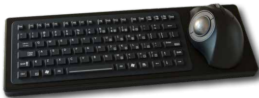
RKTE85 silicone rubber with ergonomic trackball - backlight