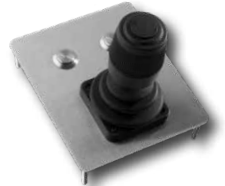
CST100 dual function IP67 joystick