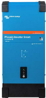
Phoenix Inverter Smart 12/2000